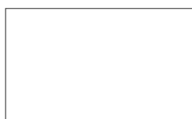
WHITE (RAL 9016)